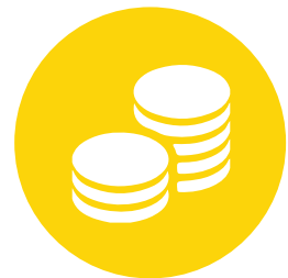
Funds Held in Trust for Financing